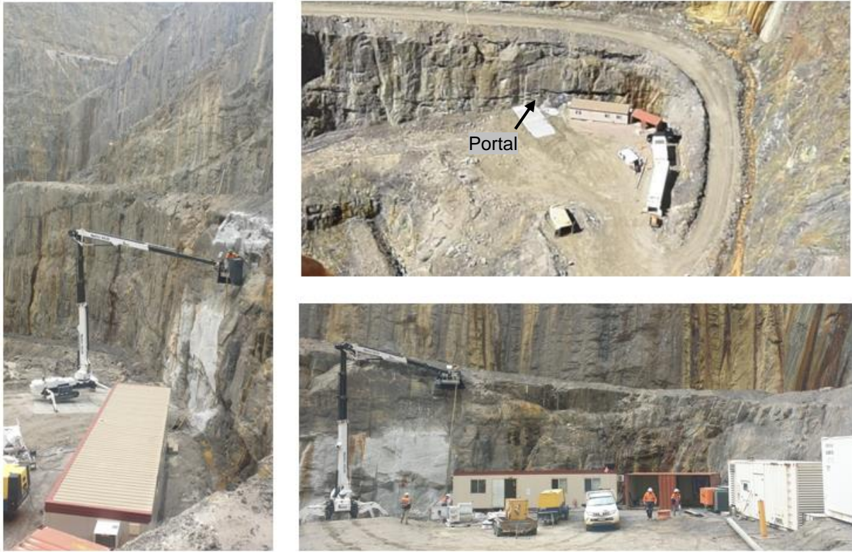
Figure 3 Layout of the Kanmantoo Underground looking south across the Giant Pit