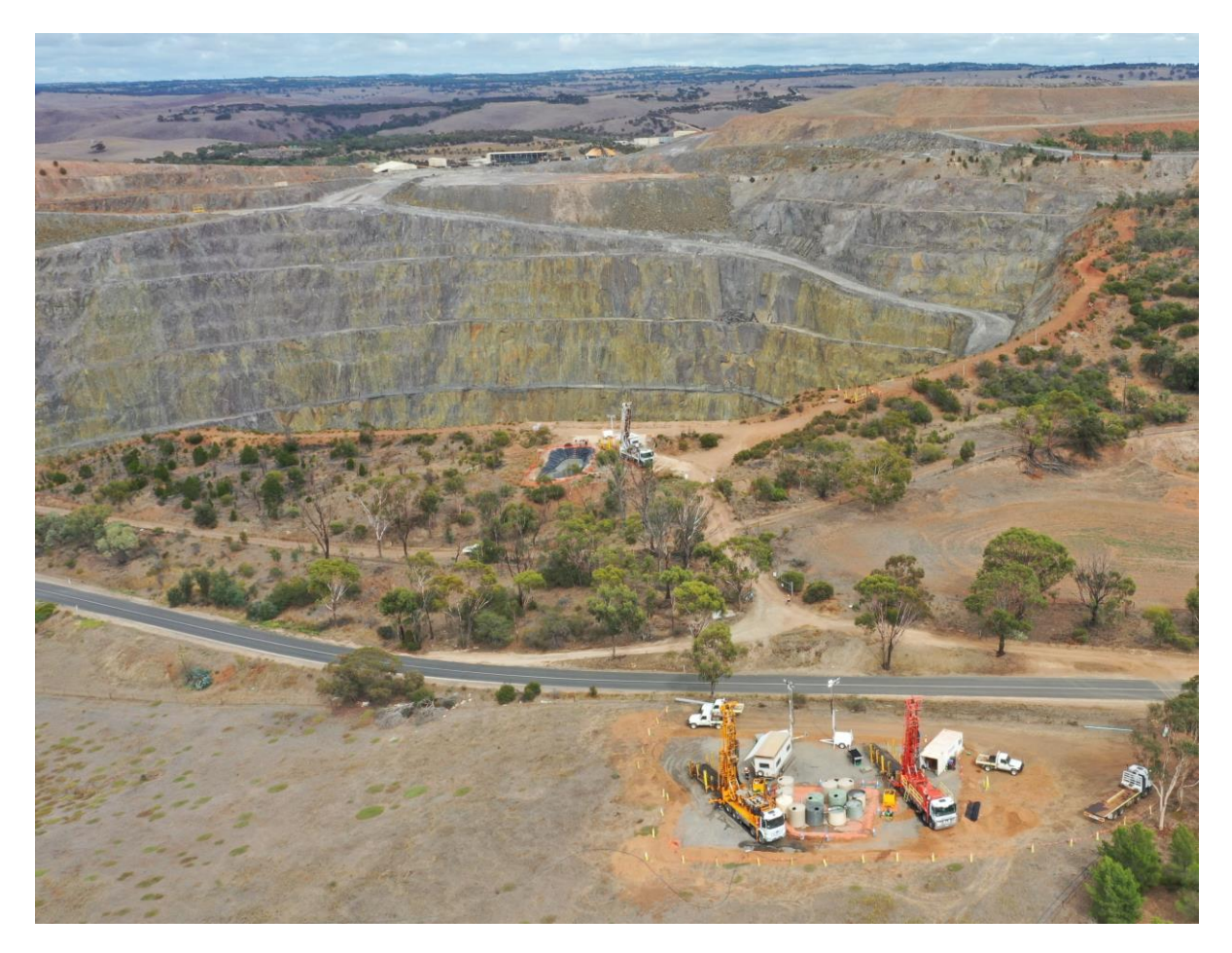
Figure 1: three drill rigs in operation

Figure 1 shows the three drill rigs in operation at the north-eastern end of the open pit, with the image looking south-west across the Giant Pit and towards Hillgrove's copper processing facility.