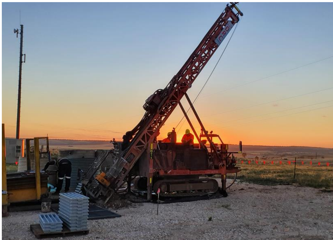
Figure 1 Drill rig at Nugent

Two additional rigs will be added to the program shortly as exploration ramps up significantly at the Kanmantoo Copper Project and expands to include drilling at Spitfire, South West, and North Kavanagh.