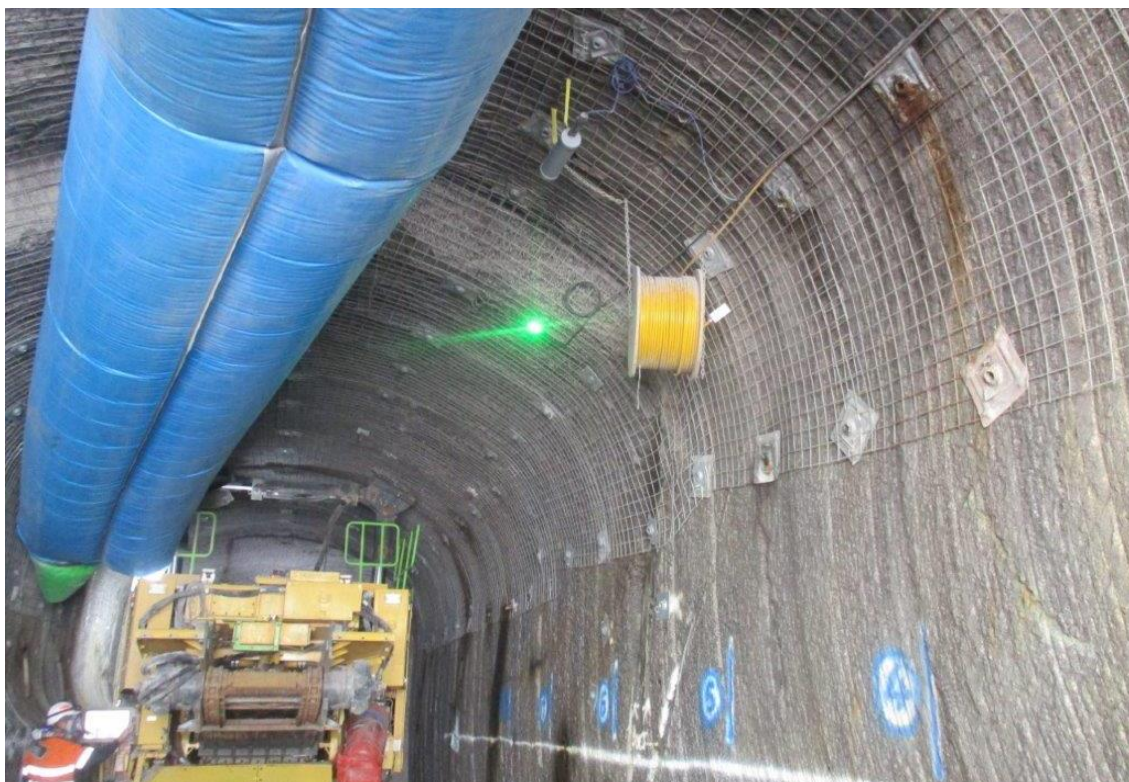
Figure 1 Quality of walls within the decline are exceptional