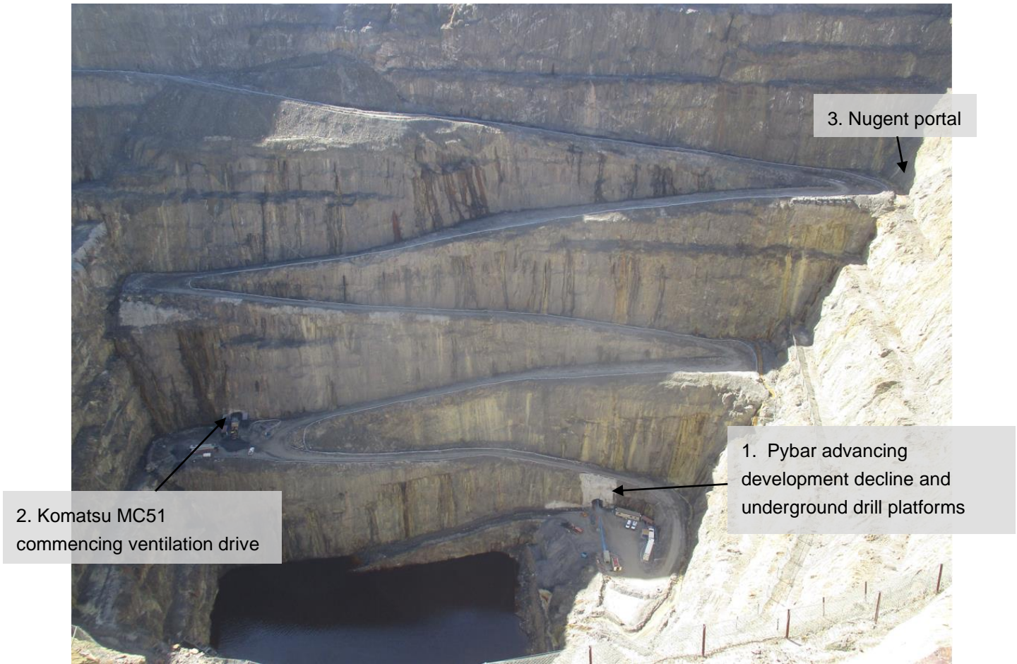
Figure 4 Preparation for first underground development blast